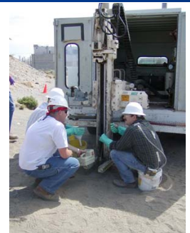
Onsite Testing Available