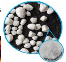
Arsenic Adsorption Media